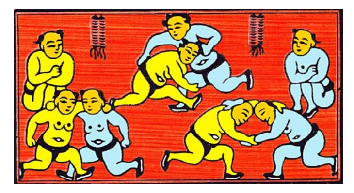
Tranh Đông Hồ

The candidates must be shirtless, and are dressed in a sort of belt with "loincloth". There is no distinction level, grade and weight. Punches, kicks... are prohibited. They can catch their